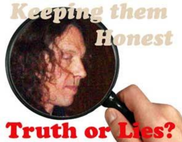
o) sign honest face sinclair