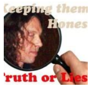
r) sign honest face sinclair-150x150