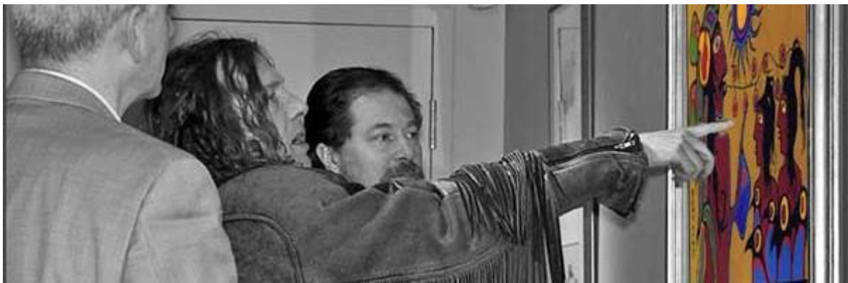
g) sinclair krg points col-600x198