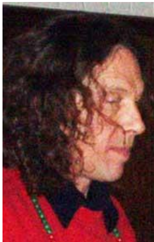
w) sinclair c190a