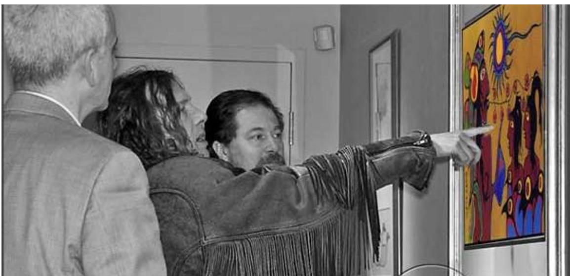
h) sinclair krg points col-600x288