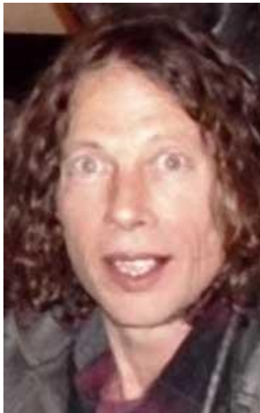
s) sinclair 190c