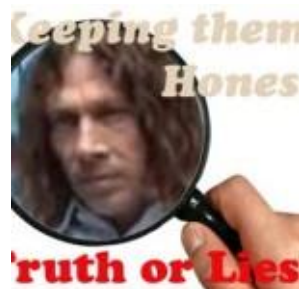
q) sign honest face sinclair2-150x150