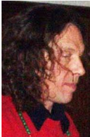
v) sinclair c190-190x288