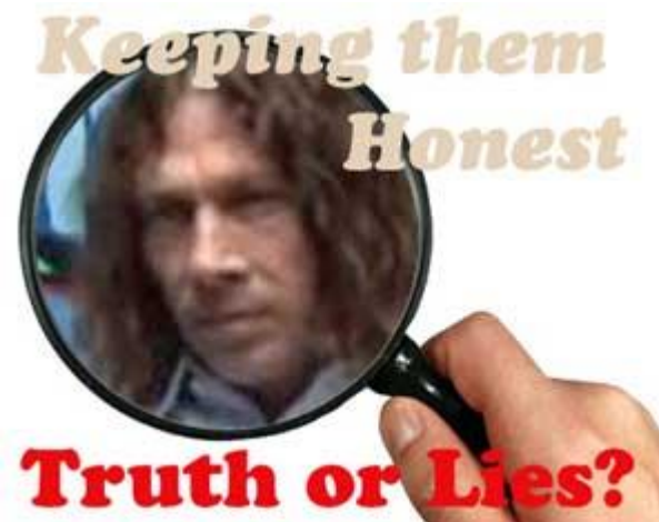
p) sign honest face sinclair2