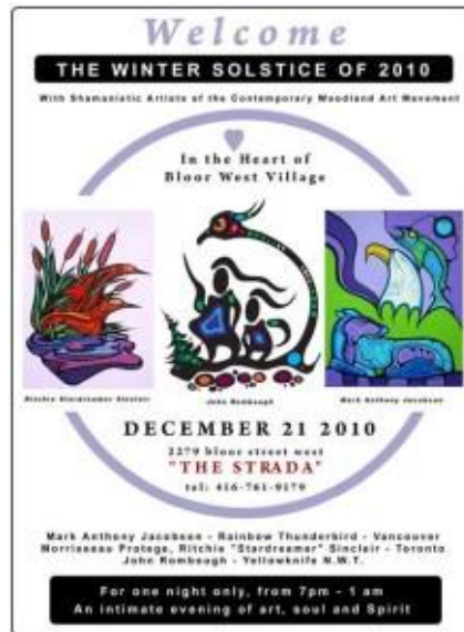
m) poster sinclair maj-219x300