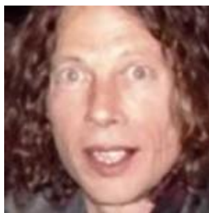
t) sinclair 190c-150x150