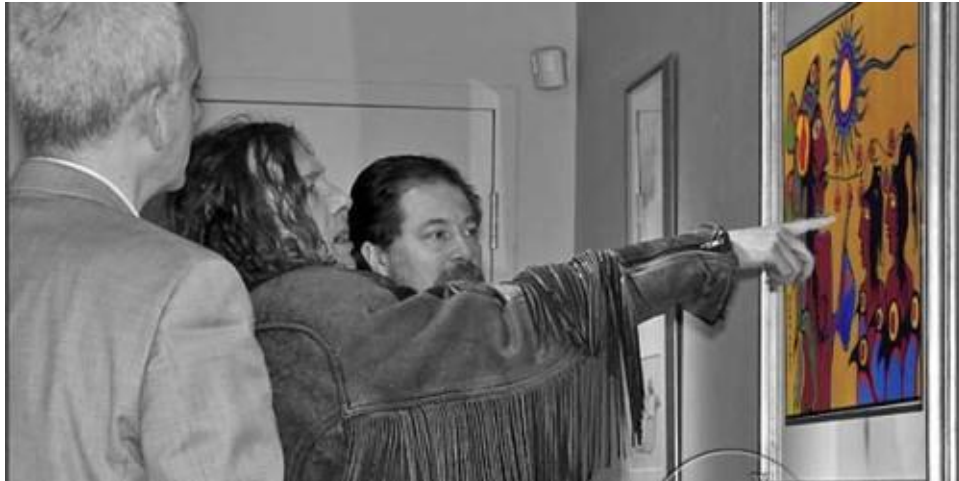
f) sinclair krg points col-500x250